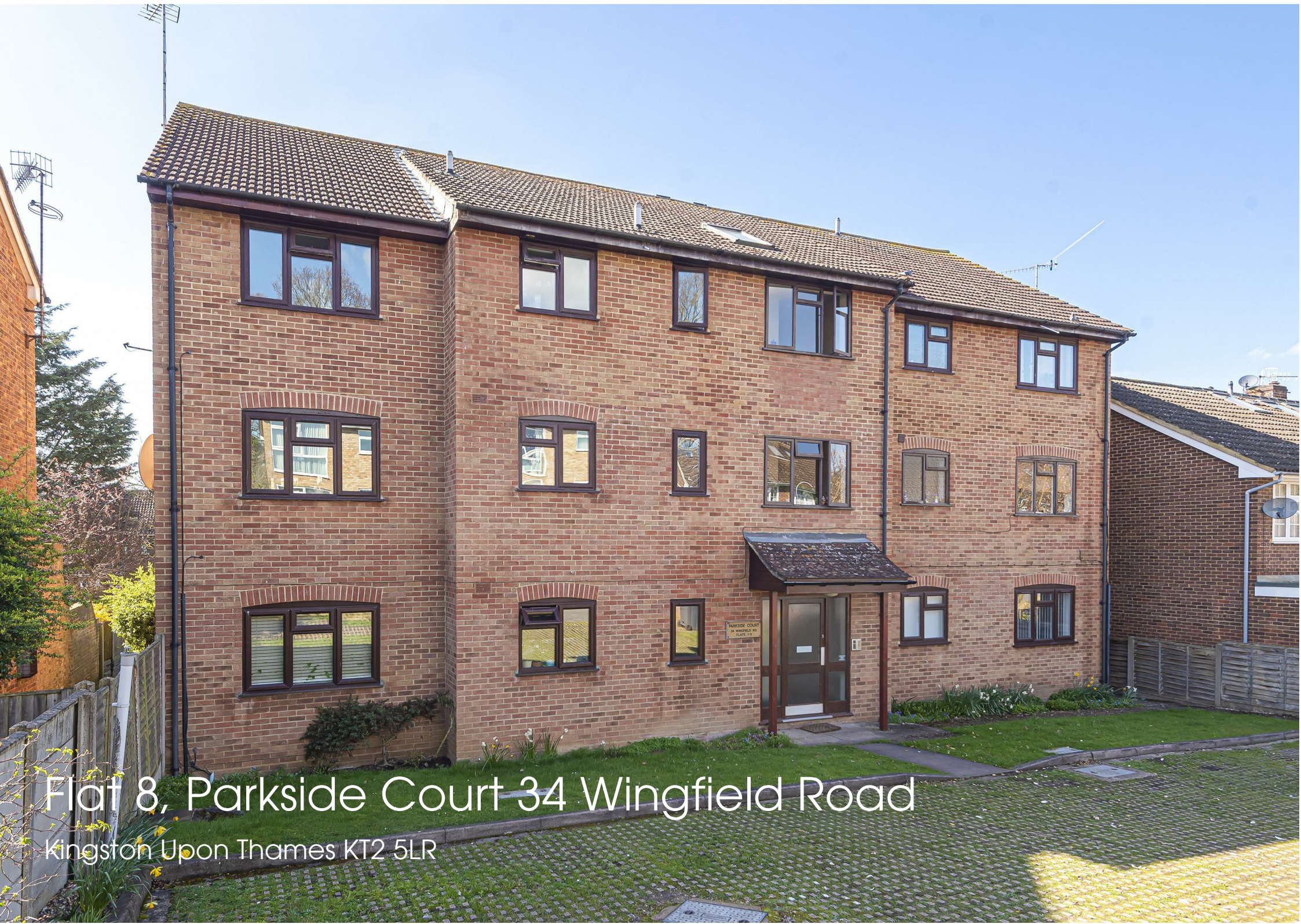
Flat 8, Parkside Court 34 Wingfield Road Kingston Upon Thames KT2 5LR